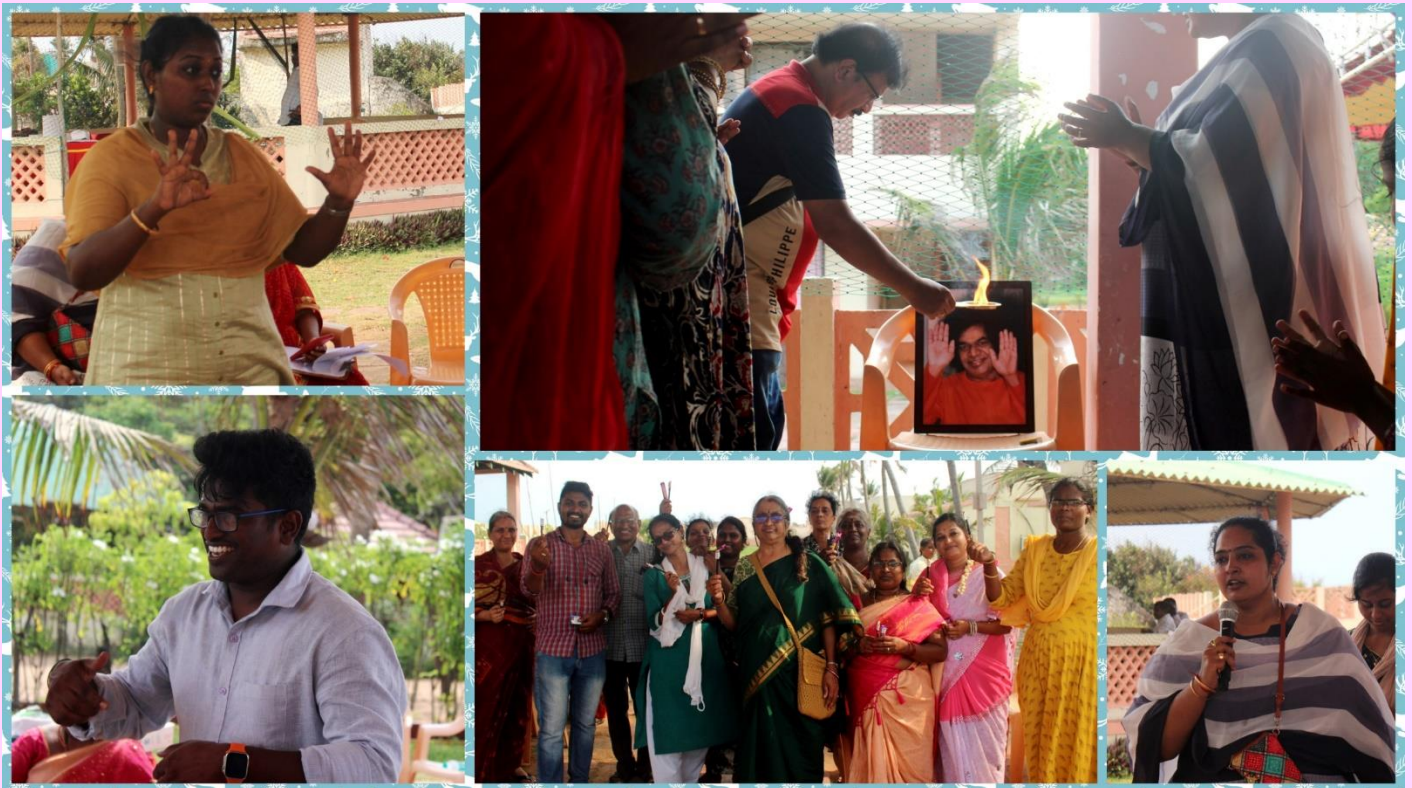
Dumb charade followed by Mangala Arathi to Bhagawan