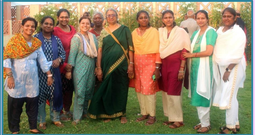
Blue Lagoon Group Photo