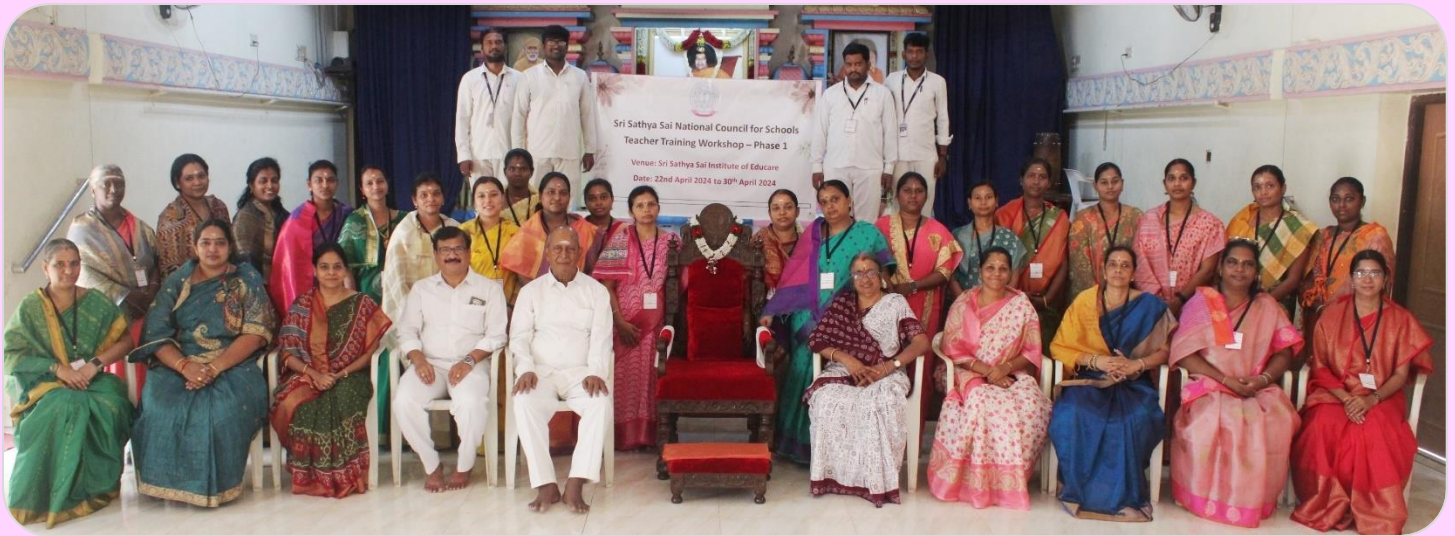
Group Photo of the Teacher Training Course-Phase 1, SSSIE, Chromepet