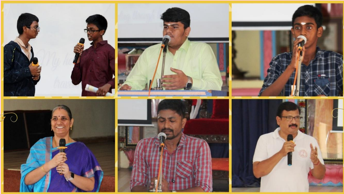
Telugu new year day celebration