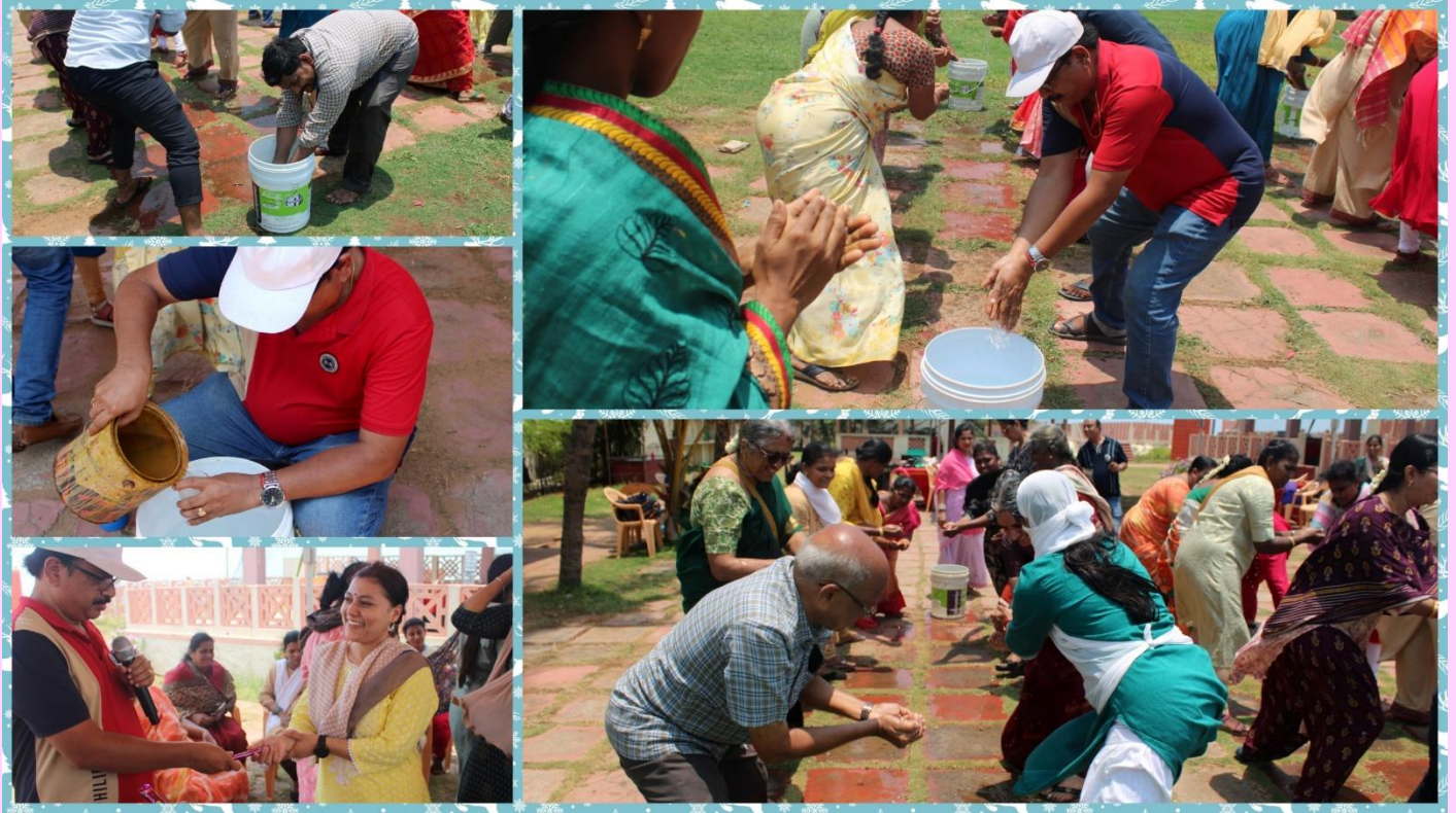
Water Pass - Value game on Team work