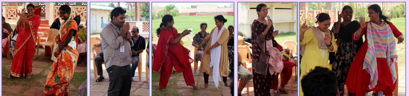
Ball pass and spontaneous performance by the teachers