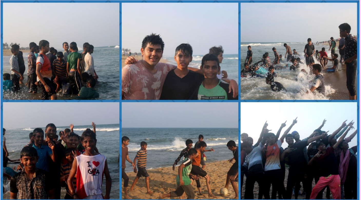
Students having play time on the Neelangarai beach