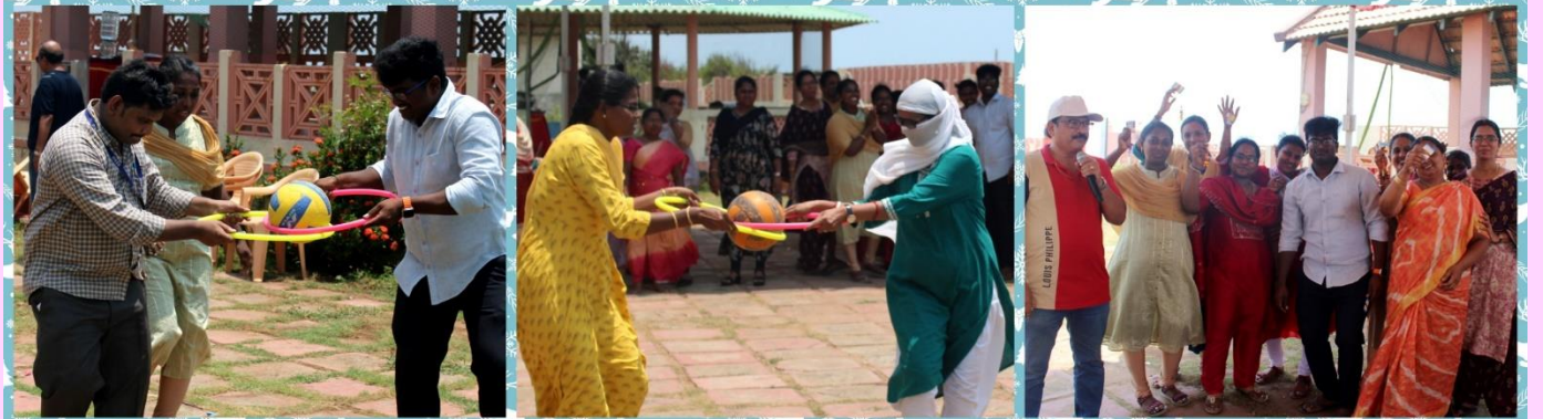
Hook the ball - Value game on hard work and steadiness