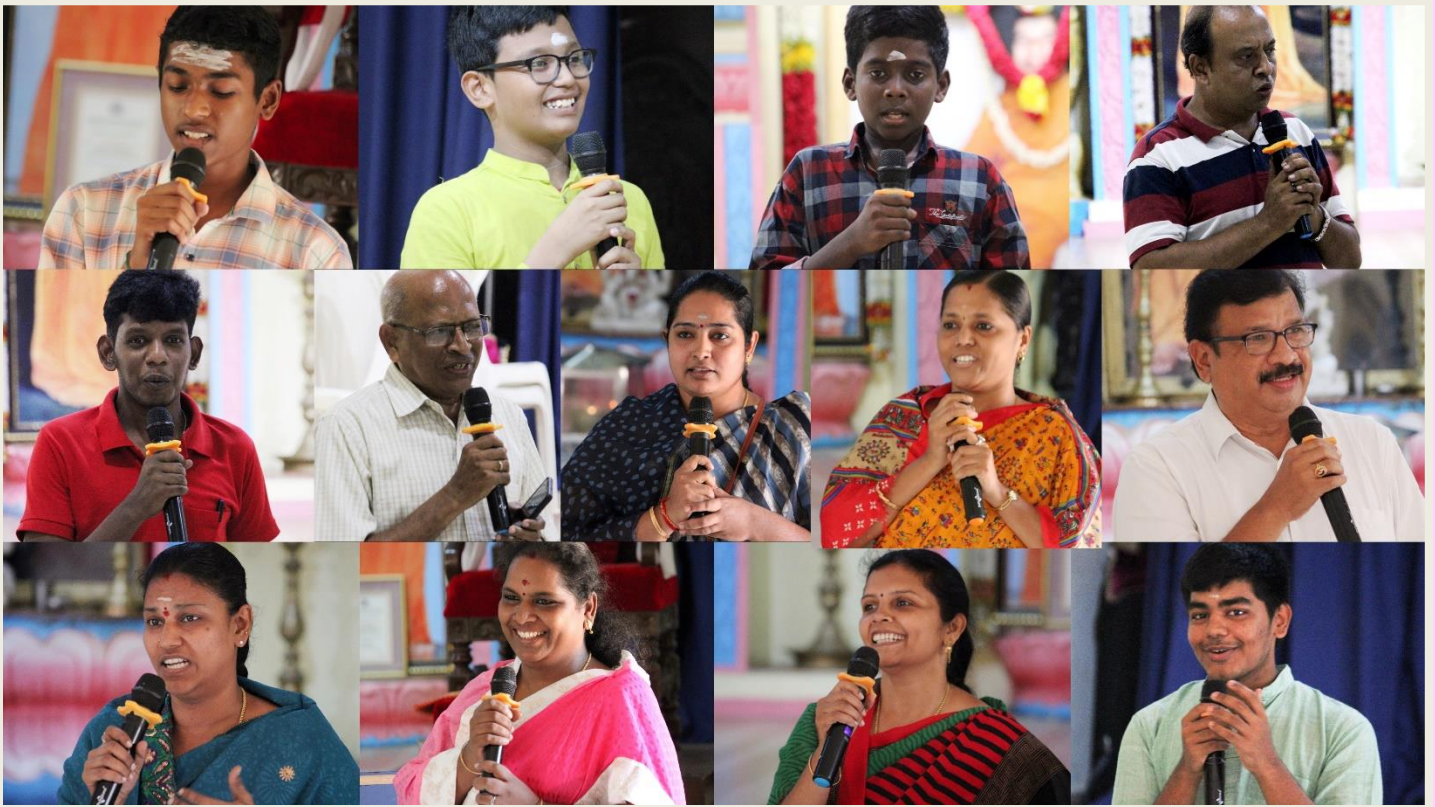
Address by the Management, staff and students on Tamil new year