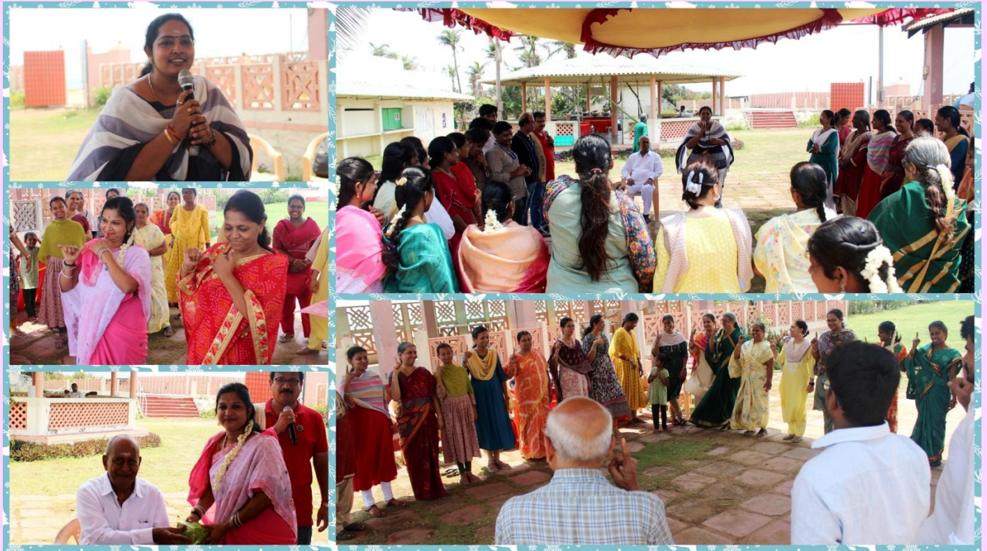
Radha Krishna - Value game on Memory power