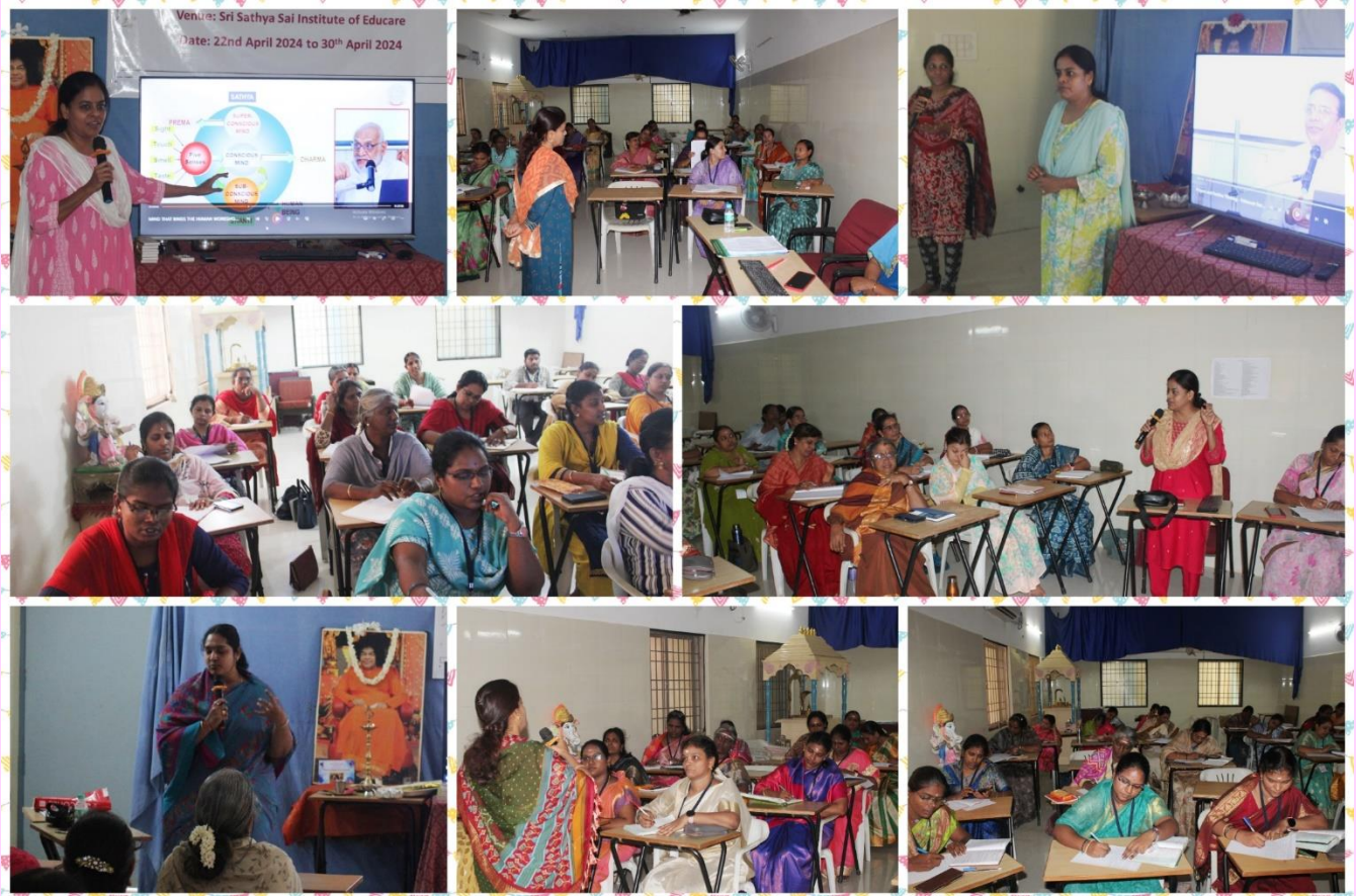
SSSNCS Teacher Training Course – Phase 1 Glimpses