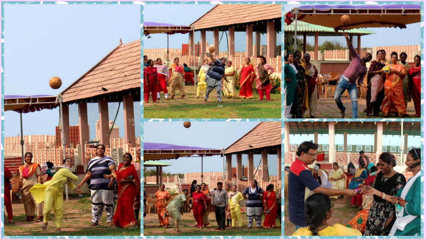
Throw ball game