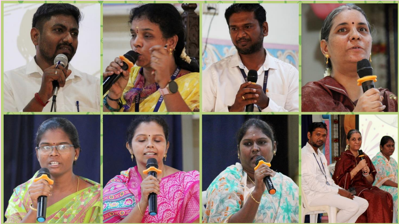
Glimpses of the Sai Ashtottara Story presentation by Sathyam Group teachers and staff