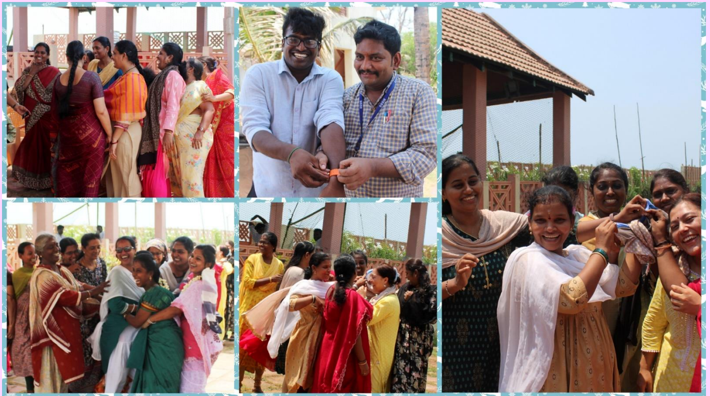
Catch the colour - Value game on mind alertness