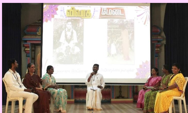
Presentation by Sathyam Group

During the month of April, the daily assembly was performed only by the teachers and the staff. The Divine theme of Sri Sathya Sai Ashtottara Namavali and the divine story associated with the Namavali was taken up for group presentation by the teachers. All the teachers were divided into 3 separate groups as Sathyam, Shivam and Sundaram and presented the stories in an interactive way using PPT. The presentation made the students understand the Mission of Bhagawan and his Divine miracles. It also directly made the teachers realize the glory of Lord Sai.