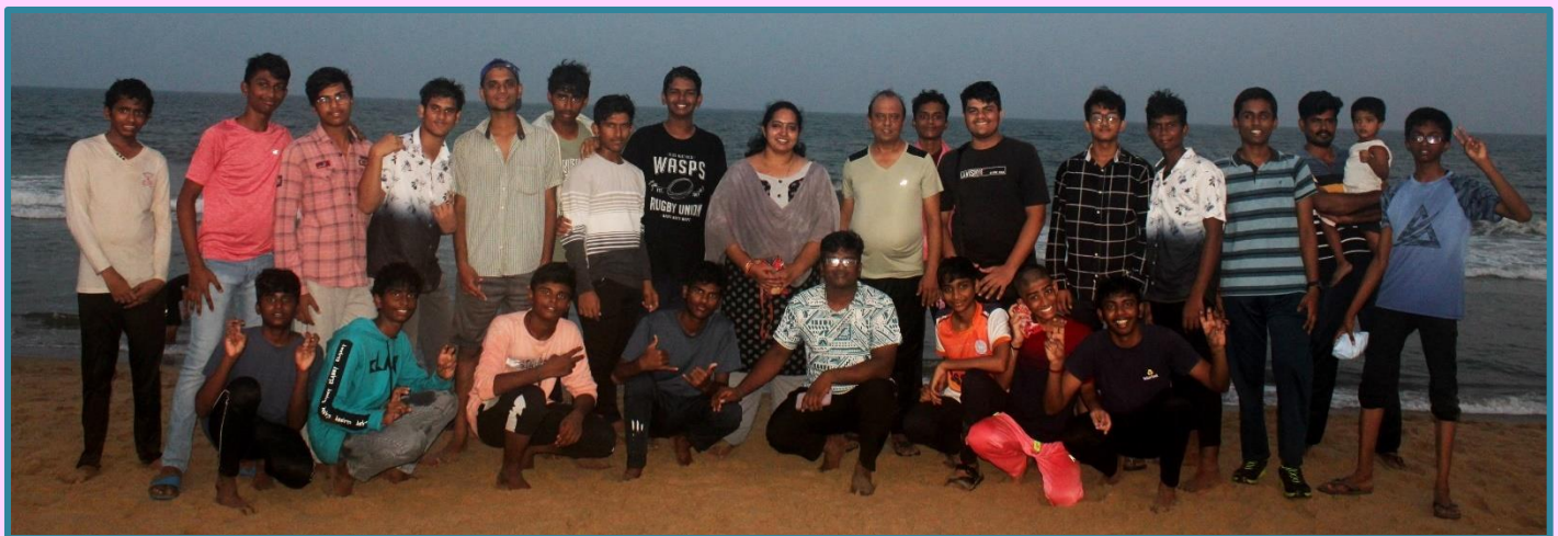
Group photo with class X and class XII students