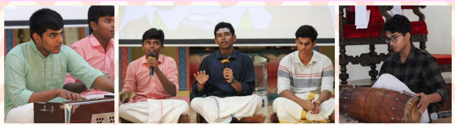
Musical offering by class XII students