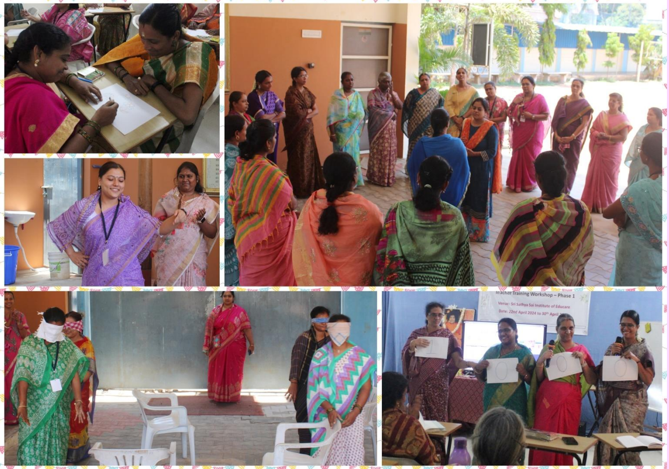
Glimpses of different activities conducted for the participants