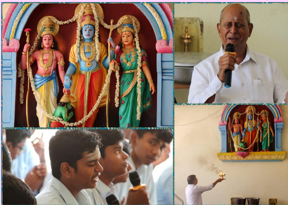
Rama Navami Celebration

Rama Navami was celebrated with offering of special prayers and satsang in the assembly on 17 th April 2024.