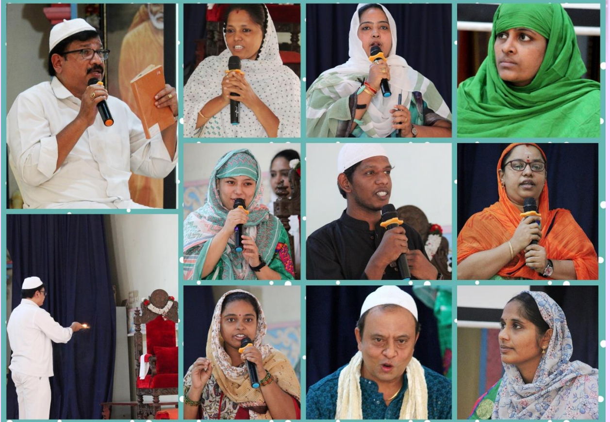
Sundaram group teachers and staff bringing out the essence of Ramadan through the Sri Sathya Sai Ashtottara Stories theme