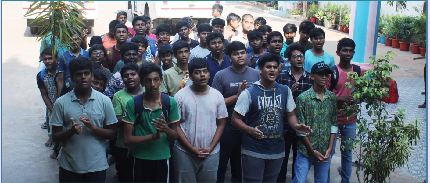
Prayer before the beach session

The class X and XII hostelers had fun time on the beach on 13 th April 2024. The group with staff members visited the Neelankarai beach and enjoyed the session by taking bath in the sea and playing games on the beach.