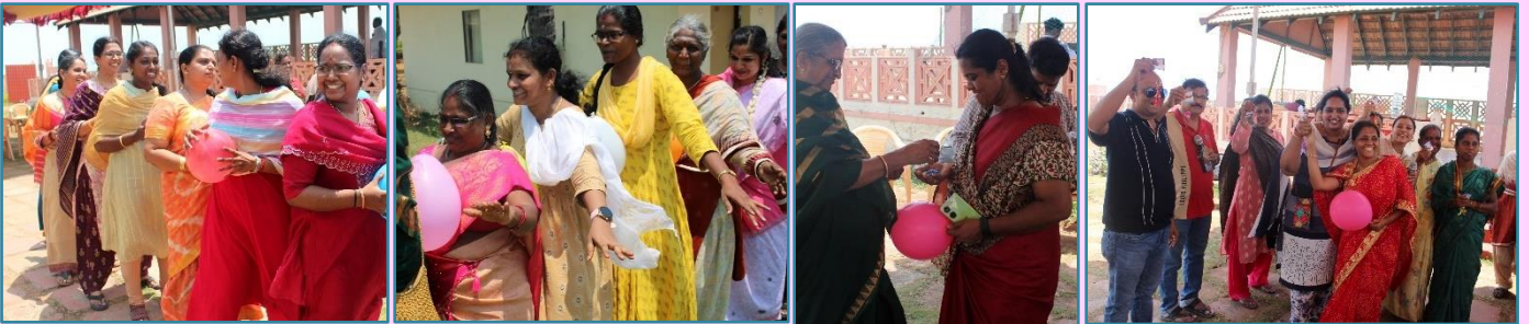
Caterpillar - Value game on Co-ordination and Co-operation