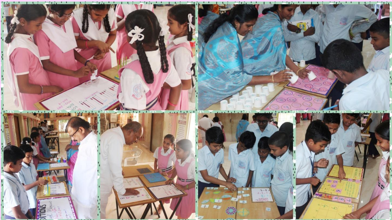
Primary Maths exhibition glimpses