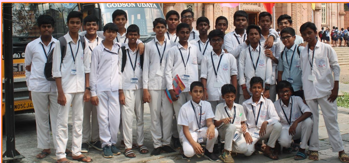
SSSIE Academic Toppers who were part of the trip