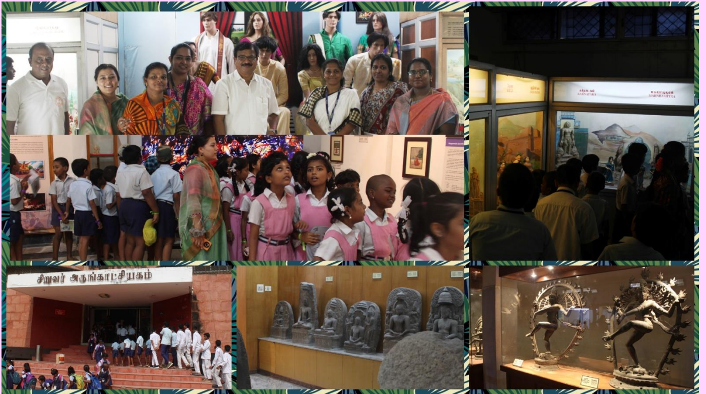
Students and staff going through the Museum