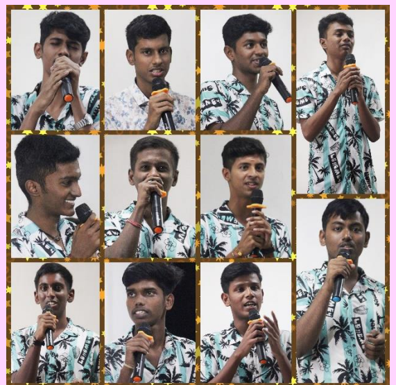
Class XII students and their glimpses during the interview session