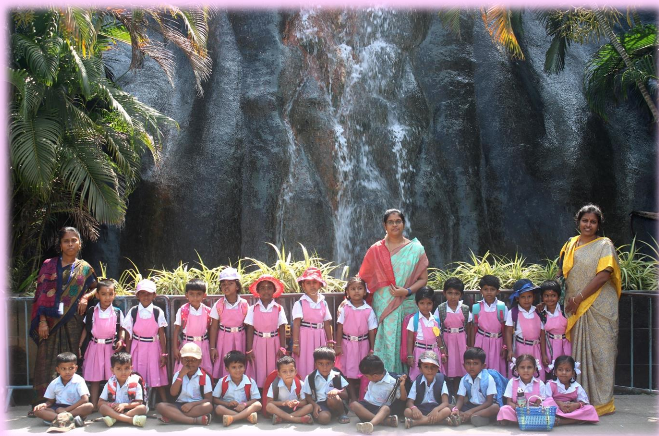
Vandalur Zoo visit by KG children