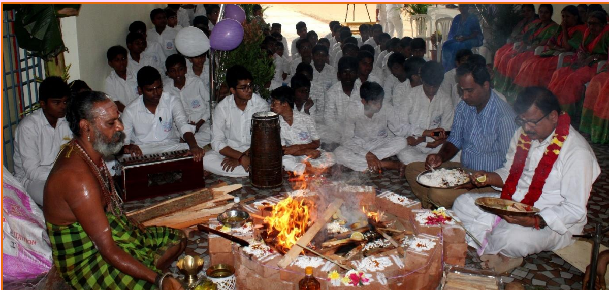
Homam in progress