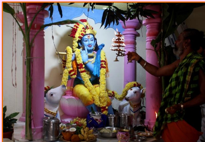
Kumbabishekam to Lord Sri Sai Krishna Mandir