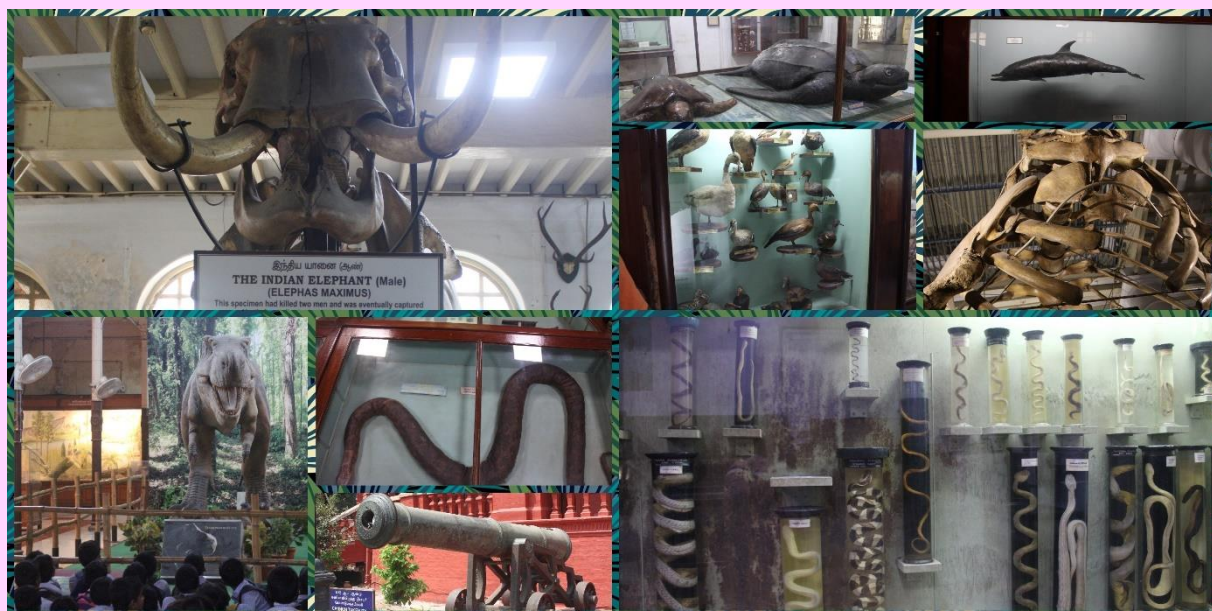
Taxidermy and other models watched by the children at the Museum