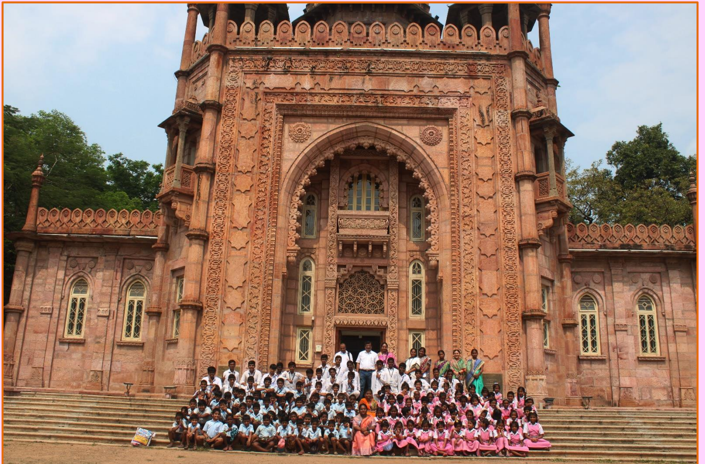
Group pose in front of the Museum building