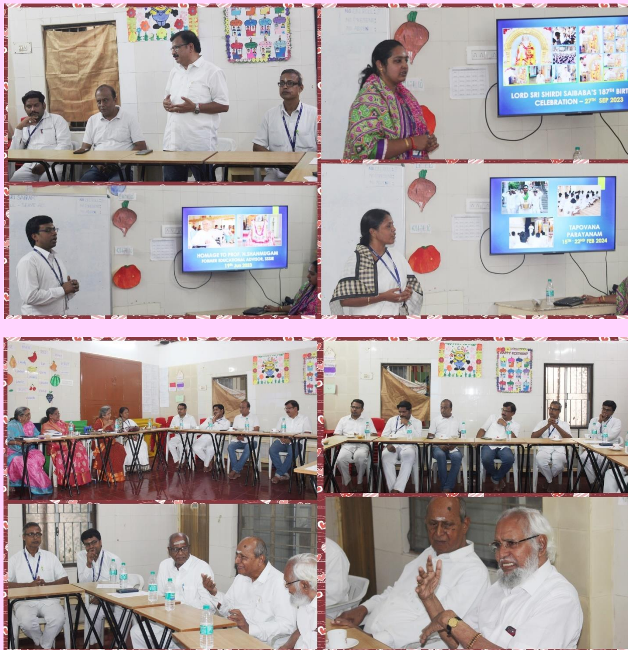
Glimpses - SSSIE Management Committee Meeting