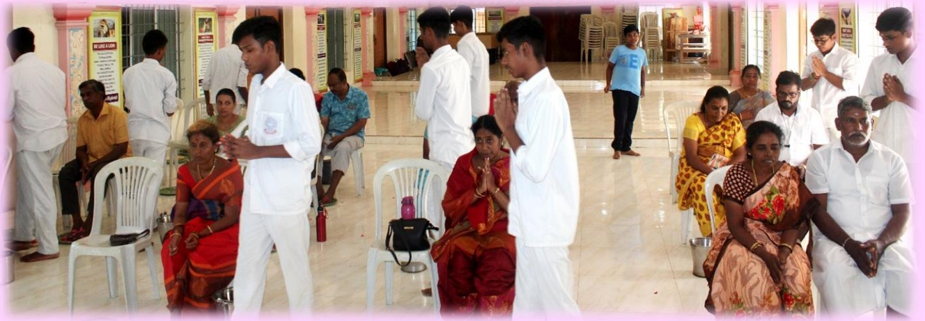
Students taking Pradakshina around their parents