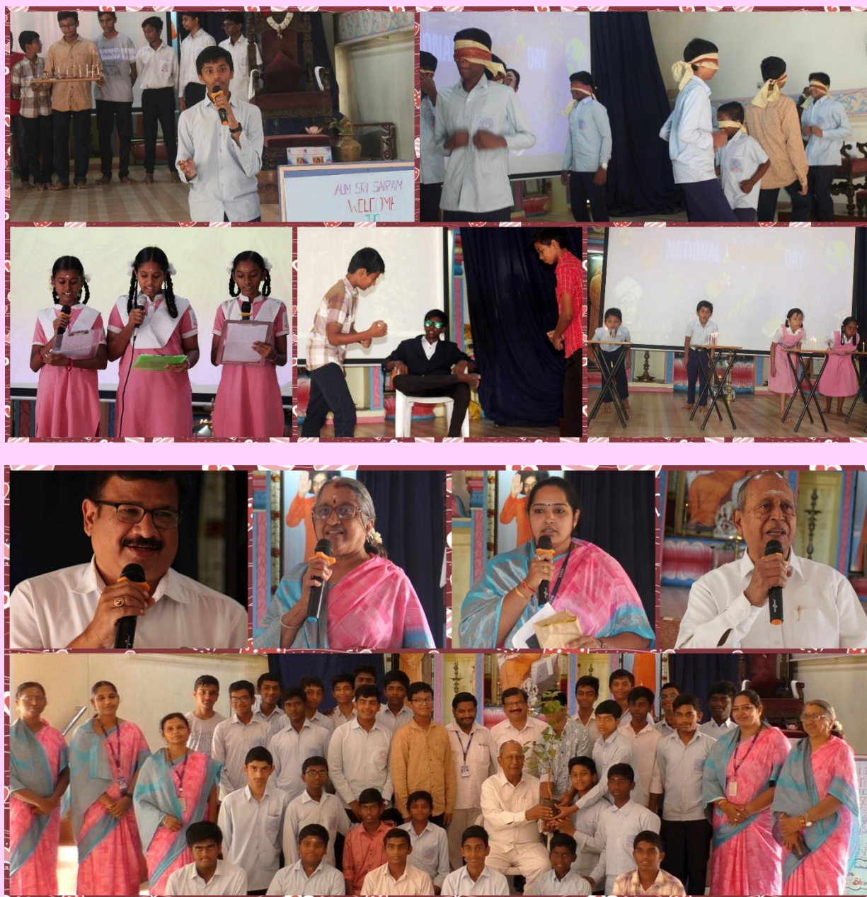
National Science Day Celebration - Glimpses