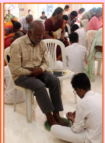
Glimpses of students performing Pada Puja to their parents