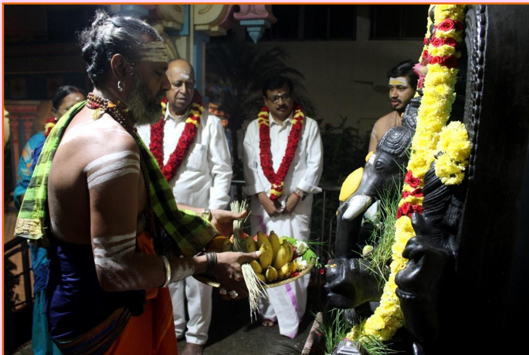
Puja to Lord Sri Vidya Ganesh in the early morning