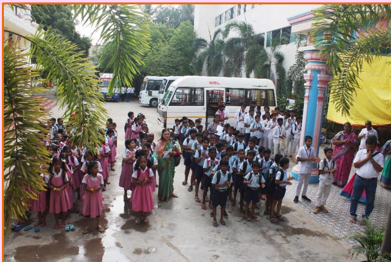
Students and Staff performing prayer before the trip