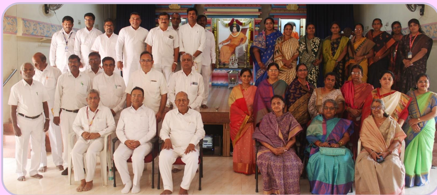
Group pose of the SSSNCS TN Meeting