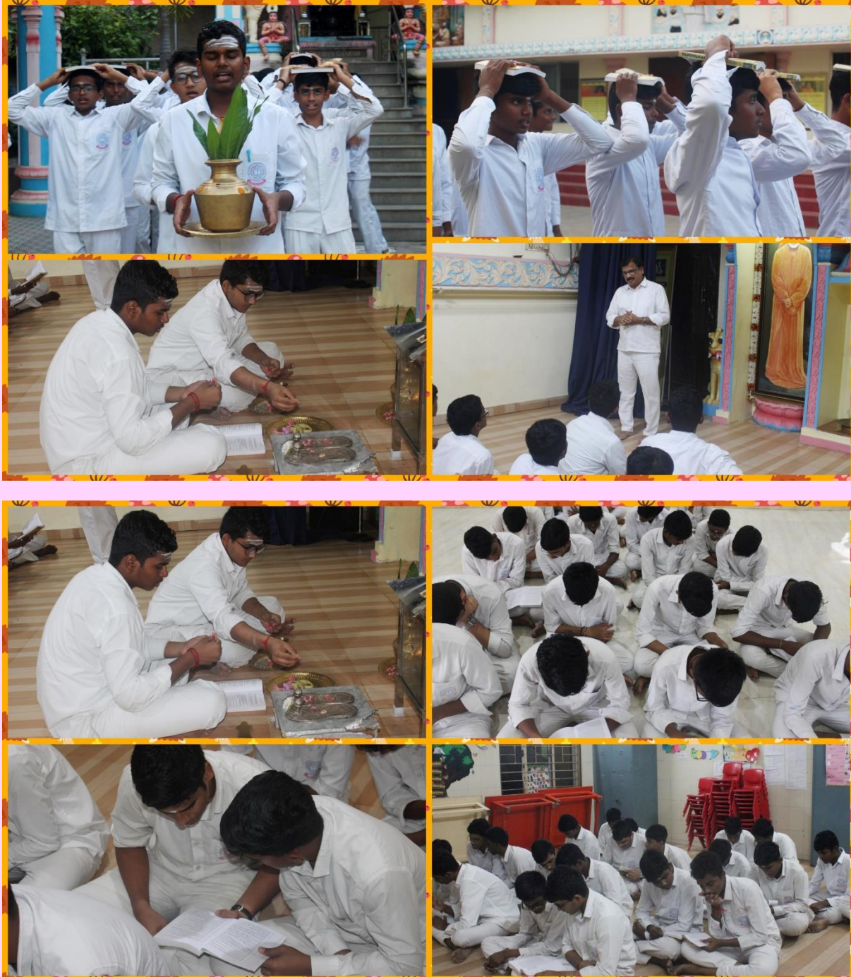
Tapovana Parayanam glimpses