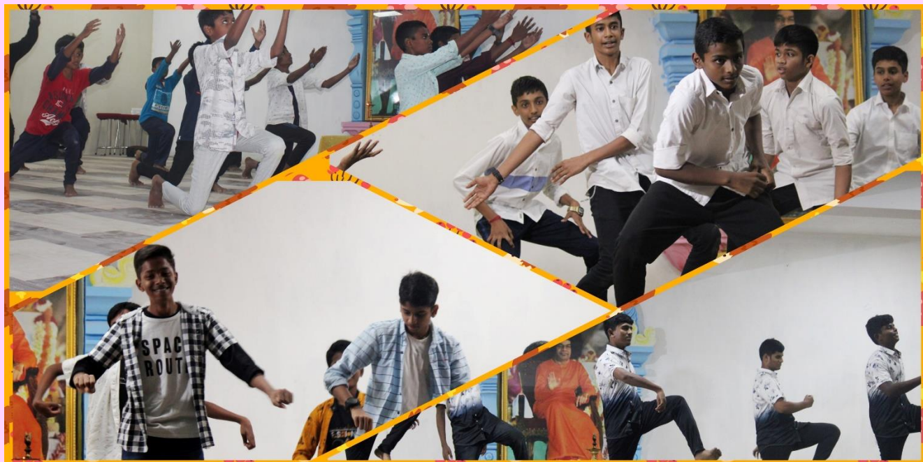
Junior students expressing their Love towards their senior brothers through their dance performance