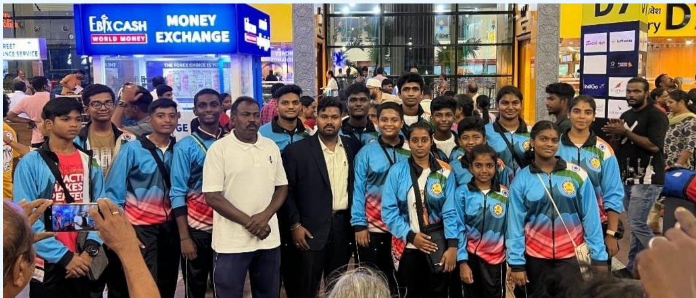
SSSIE Karate students and other participants with their Masters at Chennai Airport