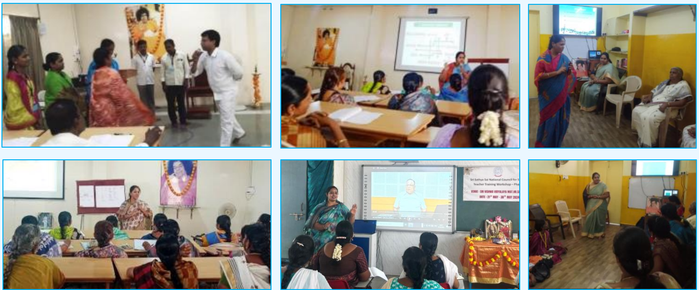
SSSIE Teachers as Resource Persons at Sai schools, TN during the SSSNCS Teacher Training Course